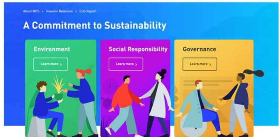
Monolithic Power System's Commitment to the Environment, Social Responsibility and Governance (ESG)